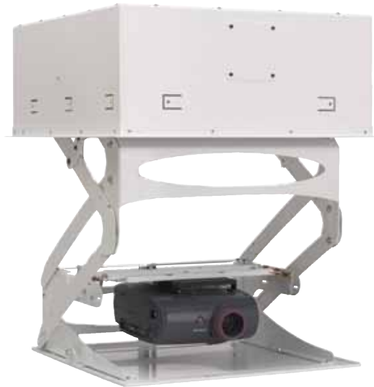
Automated Projector Lift with up to 36" of Extension