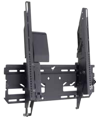
CM8T15U Automated Flat Panel TV Tilt Wall Mount