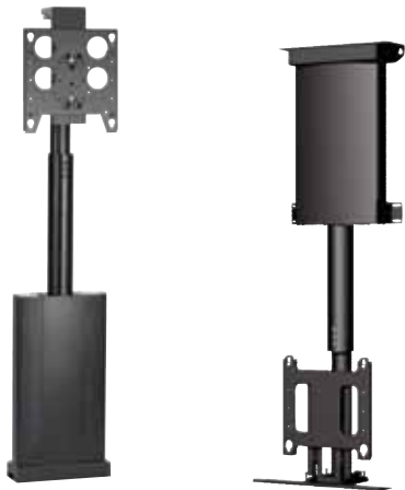
CM2C40U / CM2L40U Automated Flat Panel TV Lifts