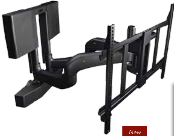
PXRU Automated Flat Panel TV Wall Mount