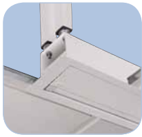
Perfect integration into the ceiling