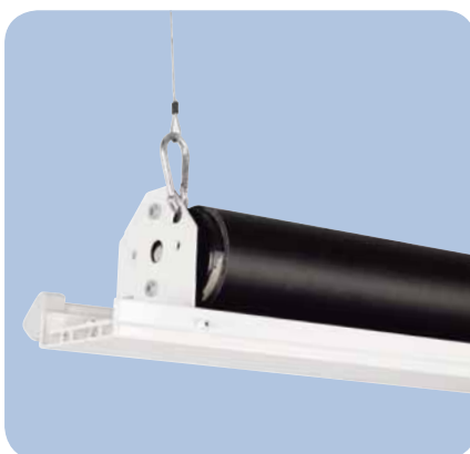
Screen Surface Assembly