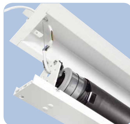
Assemble the screen at a later stage