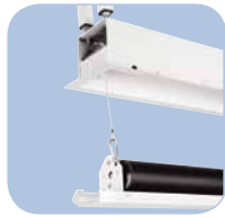
Easy Serviceability System