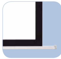
Triangular slat bar retracts into the case